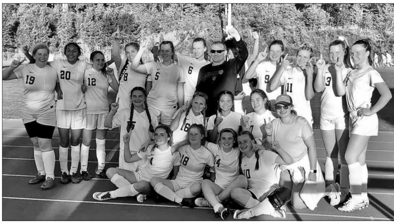
Towns County Lady Indians following the Region Championship victory at Lincoln County.

On the boys' side of things that Tuesday, the Indians were attempting something no other soccer team has ever done before at Towns County – a region sweep – but they had to try it missing two senior starters due to red cards from the April 9 match against Banks County. Fortunately, the Indians